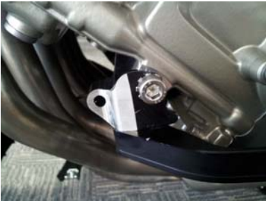
Left-side mounted - Close Up