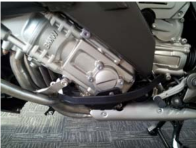
Left-side mounted - with Tip Over