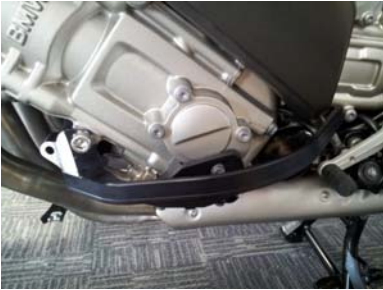
Left-side mounted - No Tip Over