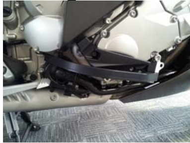
Right-side mounted - No Tip Over