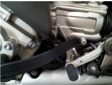
Left-side tail - Close Up