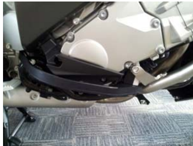
Right-side mounted - with Tip Over