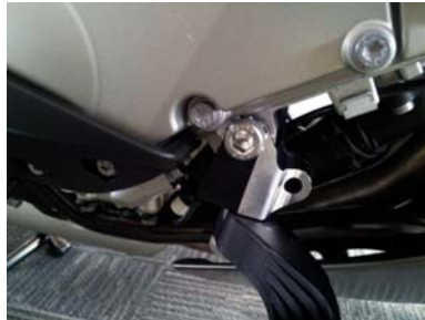
Right-side mounted - Close Up