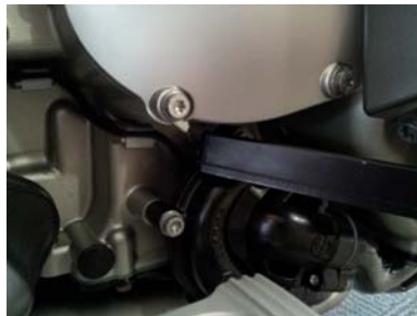
Right-side tail - Close Up